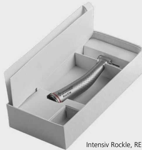
Intensiv Rockle, REF WK-900 LT