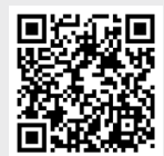
Film Intensiv Rockle use