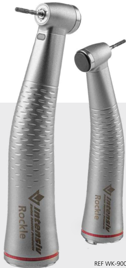
REF WK-900 LT