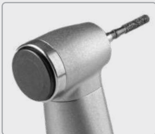
Big black push button