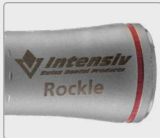
Red ring 1:4